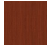
Orange Crush Wash