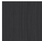
Slate Gray Wash