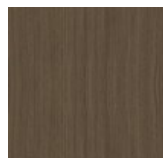
Turtle Dove Wash