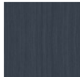
Blue Skies Wash