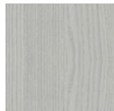
White as Snow Wash