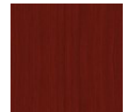
Ruby Red Wash