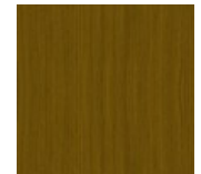
Mellow Yellow Wash