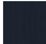
Sapphire Blue Wash