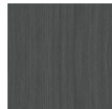
Smoke Gray Wash