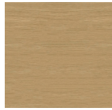
Solid Oak with clear finish (standard)