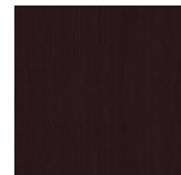
Vintage Red Wash