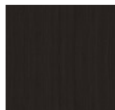
Nut Brown Wash