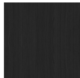
Back to Black Wash